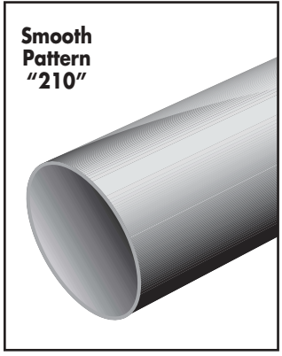
Smooth Pattern "210"

Pole: Poles are formed from tubes conforming to the ASTM A595 process with a constant linear taper of 0.14"/ft. The wall thickness is available in 11 ga. (0.1196") or 7 ga. (0.1793"). The tube's seam weld is formed by the Electric Resistance Weld (ERW), and is smooth with no visual appearance.